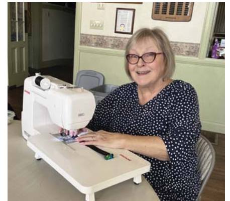
This is actually fun!