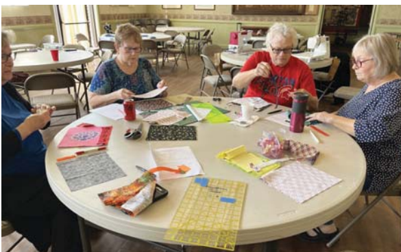
I think we are getting it now!