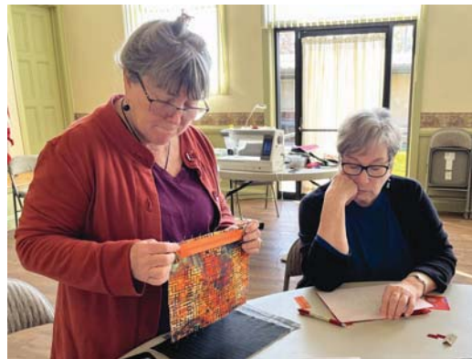
Hmmm. How's this going to work?