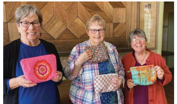
Success! Beautiful bags, ladies!!!